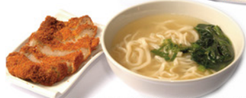
★★ 豬扒湯麵 Noodle Soup with Sliced Pork Chops

★ Legend's Specialties ★★ Highly Recommend