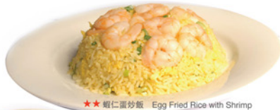
★★ 蝦仁蛋炒飯 Egg Fried Rice with Shrimp