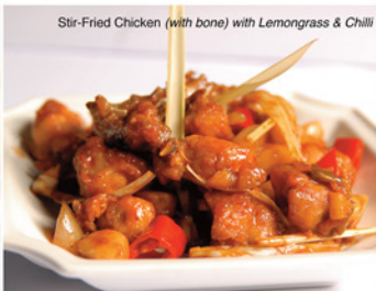
Stir-Fried Chicken (with bone) with Lemongrass & Chilli