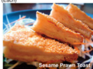
Sesame Prawn Toast