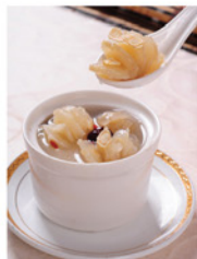
燉湯 Stew Soup