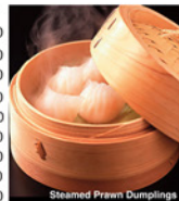
Steamed Prawn Dumplings

★ Legend's Specialties ★★ Highly Recommend