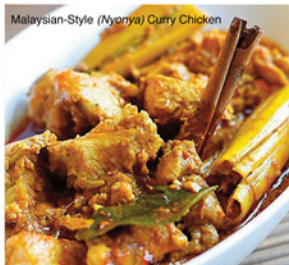
Malaysian-Style (Nyonya) Curry Chicken